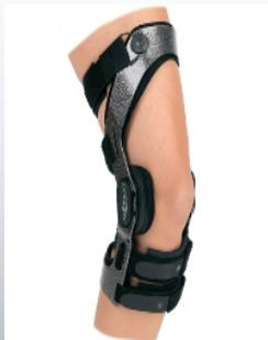
Armor Protective Knee Brace

DonJoy knee brace with single pivot uprights to provide light support for knee joint pain relief from tendonitis or ACL tears.