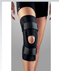
Performer Hinged Patella Knee Brace - Neoprene

DonJoy brace designed for knee joint pain relief associated with patellofemoral malalignment.