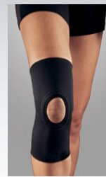
Performer Knee Support

Recommended for mild or moderate ligament joint pain, sprains, strains, Osgood Schlatter disease or patellar instabilities.