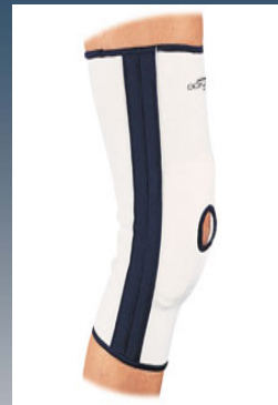
Cartilage Knee Sleeve

Great for mild to moderate unicompartamental osteoarthritis and mild ligament instabilities.