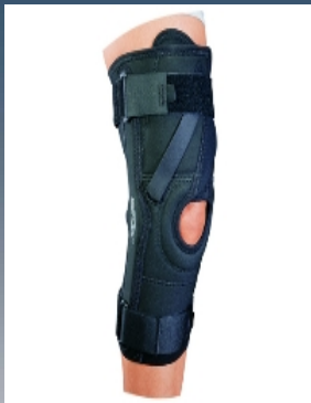
Opal Osteoarthritis Knee Brace

Low profile, lightweight, easy to apply and breathable knee brace for use by patients with mild to moderate unicompartamental knee OA.