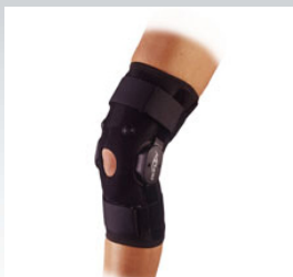
DonJoy Drytex Hinged Air Knee Brace

Recommended for mild compressive support to help promote healing and stabilize knee joint following sprains and ligament and/or meniscus injuries