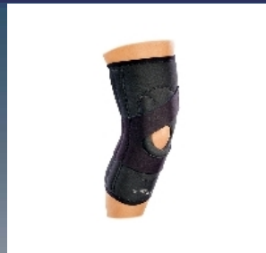
Lateral J Patella Support

Designed to place a dynamic pull on the patella during knee extension to normalize tracking