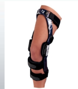
Female Fource (Off the Shelf) ACL Brace

Lightweight carbon frame brace provides durable support for moderate to severe ACL, PCL, MCL or LCL instabilities. Fits underneath clothing. Recommended for contact, extreme and water sports.