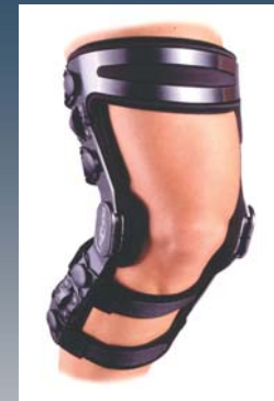
Adjuster Osteoarthritis Knee Brace

DonJoy knee brace provides compression and stability after arthroscopic surgery for meniscus tear, knee swelling and bursitis as well as ACL tears.