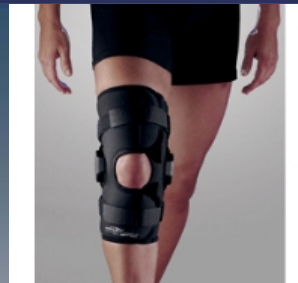
Deluxe Hinged Knee, Open Popliteal

Ideal for lateral patellar subluxation dislocations or improper patellar tracking