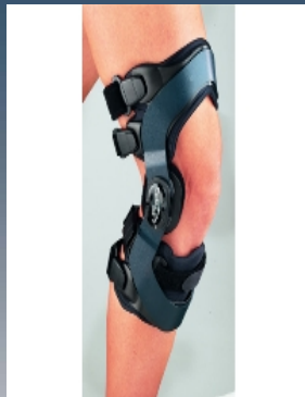
OA Everyday Osteoarthritis Brace

Low profile, lightweight, easy to apply and breathable knee brace for use by patients with mild to moderate unicompartamental knee OA.