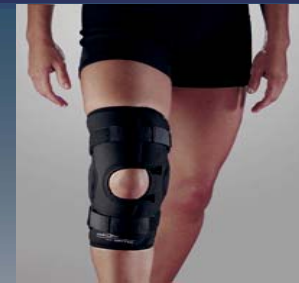
Drytex Sport Hinged Knee Support

Recommended for moderate stability for knee ligament meniscus injuries, sprains and osteoarthritis