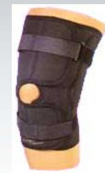
Economy Hinged Knee Support - Neoprene

Knee support for mild arthritis, knee sprains and temporary relief from inflammation and joint pain.