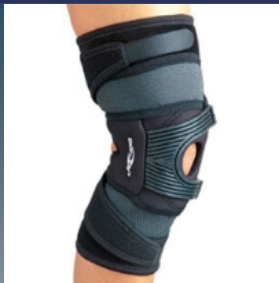
Tru-Pull Patella Tracking Knee Support

Designed to place a dynamic pull on the patella during knee extension to normalize tracking